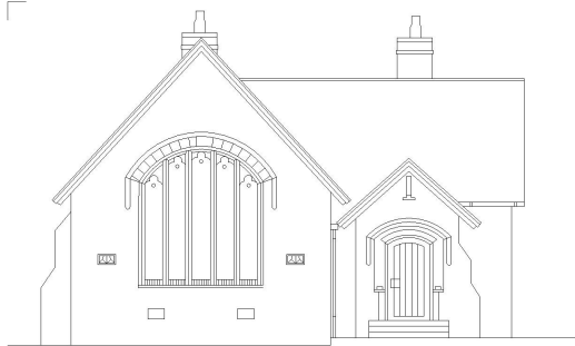
Front elevation (North)