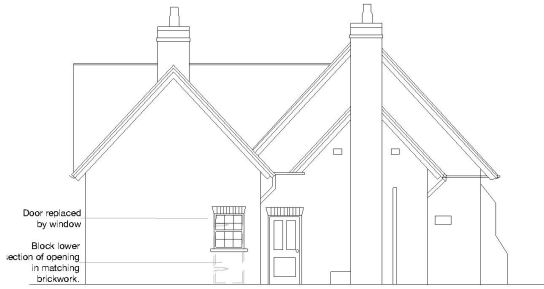
Rear elevation (South)