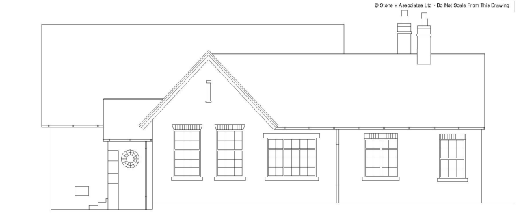
Site elevation (West)